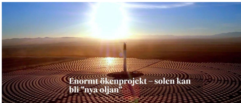
Article in Svenska Dagbladet on the future of Solar Power and Morocco's impressive ambitions for renewable power

Read the full article here: https://www.svd.se/solen-kan-bli-marockos-olja-i-enormt-okenprojekt