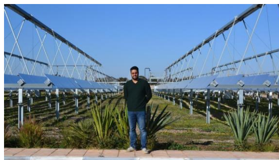
Swedish Radio on Concentrated Solar Power technology

Listen to the coverage on Sveriges Radio here: http://tiny.cc/oe9r7y